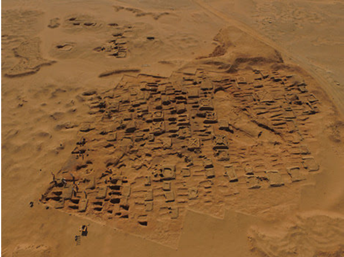
Aerial photo of the dig in December 2017

particular to the Napatans and Meroitics, who veritably revered the monuments of the past, unlike their Egyptian neighbors.