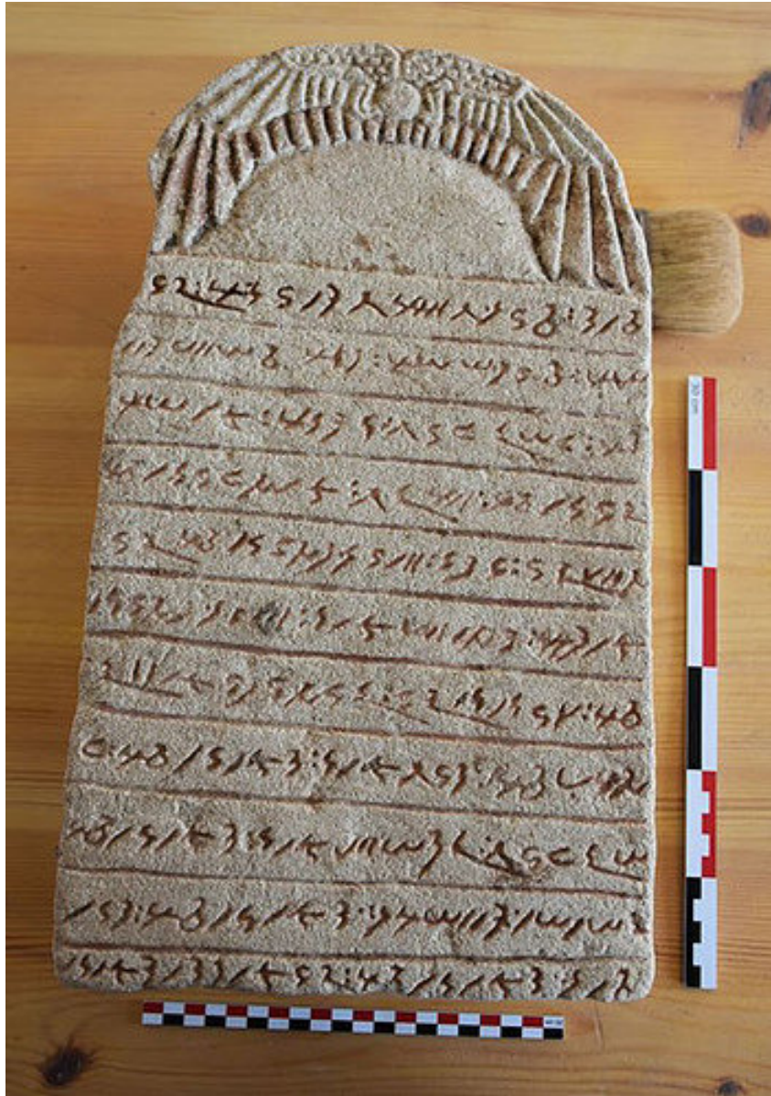
Stele in the name of Lady Maliwarase.