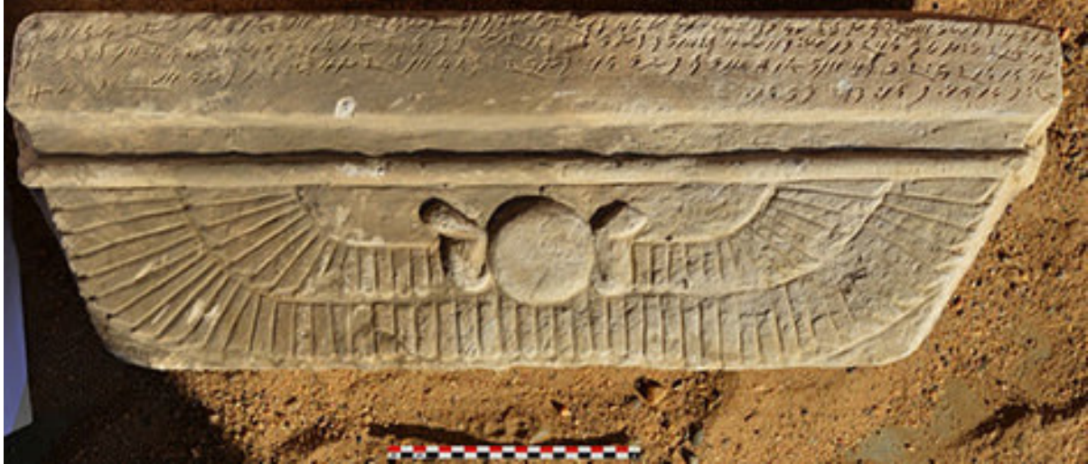
Funerary chapel lintel. The four lines of text describe the owner, Lady Adatalabe

All these discoveries advance our knowledge of Meroitic civilization, which was born of the cultural intermixing of Egypt and black Africa that still characterizes Sudan today. These funerary objects represent the largest collection of texts in Meroitic, the oldest language of black Africa, written in characters borrowed from ancient Egyptian.